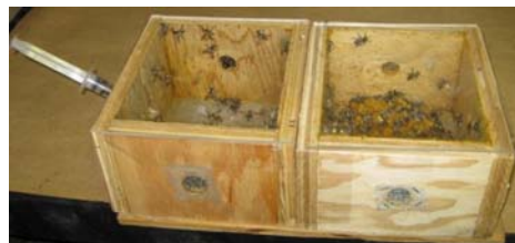
Figure 5. A full size nest box with a sugar syrup feeder.