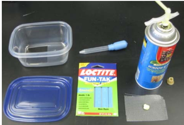
Figure 3. Items needed to make a starter box

Building your nest box. At the Logan Bee Lab, we use a two step system for rearing bumble bees. We place newly caught queens in 4in x 6in x 4in plastic boxes until the queen has workers, then the nest is transferred to a two-