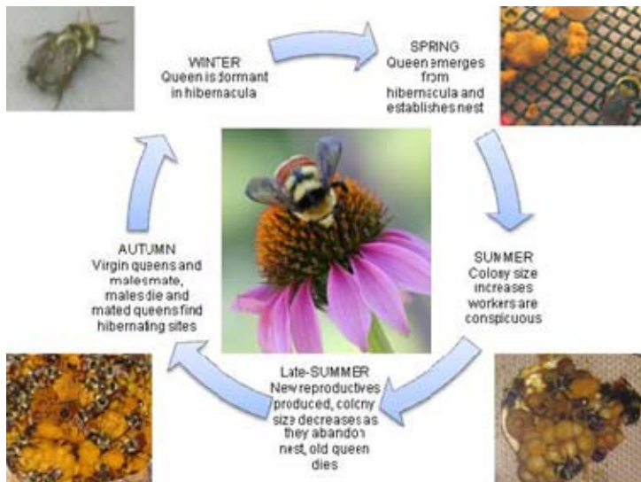
Figure 2. The life cycle of B. huntii

Bumble bees are social insects that live in colonies headed by a single queen (Figure 2). A solitary queen overwinters in the ground