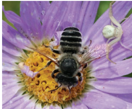
Figure 1: Leafcutter bee (and crab spider) visiting flower.

There also are concerns about leafcutter bee nesting in rose canes, excavating the