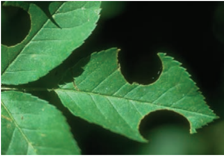
Figure 2: Leafcutter bee injury.