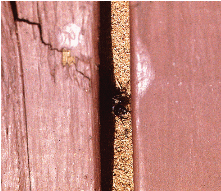
Figure 3: Leafcutter bee nesting on porch, with sawdust.

of closely packed cells are produced in sequence. A finished nest tunnel may contain a dozen or more cells forming a tube 4 to 8 inches long. The young bees develop and remain within the cells, emerging the next season.