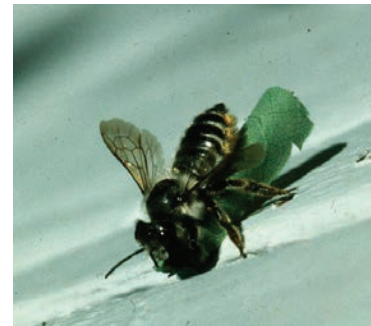
Figure 5: Leafcutter bee carrying leaf fragment.