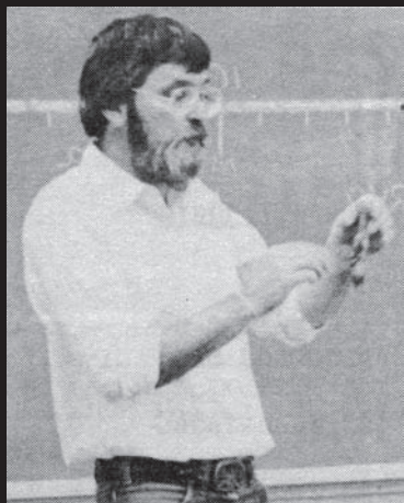
The Bee Line (July 1984)