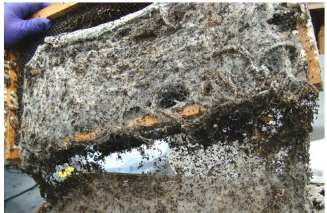
Figure 9. Wax moth larvae damage

In small colonies such as divides or splits, newly hived packages, nucleus hives (nucs), or post-swarm colonies, the SHB population can grow rapidly, beyond the colony's ability to keep it in check. Divides or splits are hives that were established by transferring frames of bees, brood, and food stores from a big or strong parent hive. A nuc or nucleus hive is a small hive consisting of five or six frames. Other factors that appear to exacerbate infestation include too-frequent hive inspections by beekeepers, declines in colony health, and a queen event (loss of queen or supersedure). In colonies having excessive space (multiple empty honey supers) or colonies that have recently swarmed, beetles can lay eggs away from the active bee population and thrive.