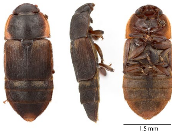
Figure 2. Dorsal, lateral, and ventral view of the sap beetle Brachypeplus basalis (family: Nitidulidae)