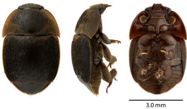
Figure 1. Dorsal, lateral, and ventral view of the small hive beetle.

Rendering: Alan Dennis, Oregon State University