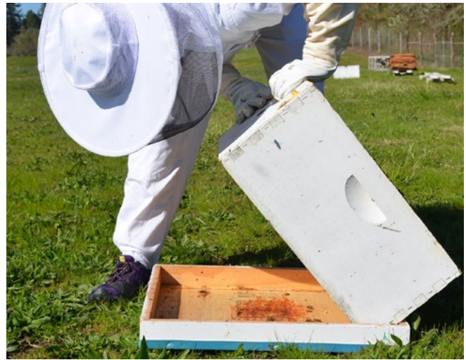
Figure 11. Lifting hive body to inspect beetles that may have moved down onto the outer cover

When a hive is opened for inspection, the beetles quickly flee and hide in hive crevices. The adult